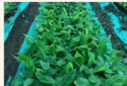
ACCLIMISED IN THE GREEN HOUSE