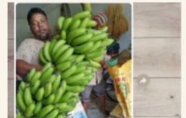
33 KG LOOM