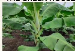
FULL GROWN PLANT